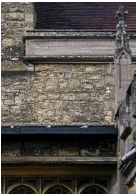
Figure 2: Join between Clearstory and Tower: South Side