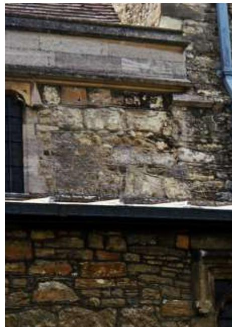
Figure 3: Join between Clearstory and Tower: North Side