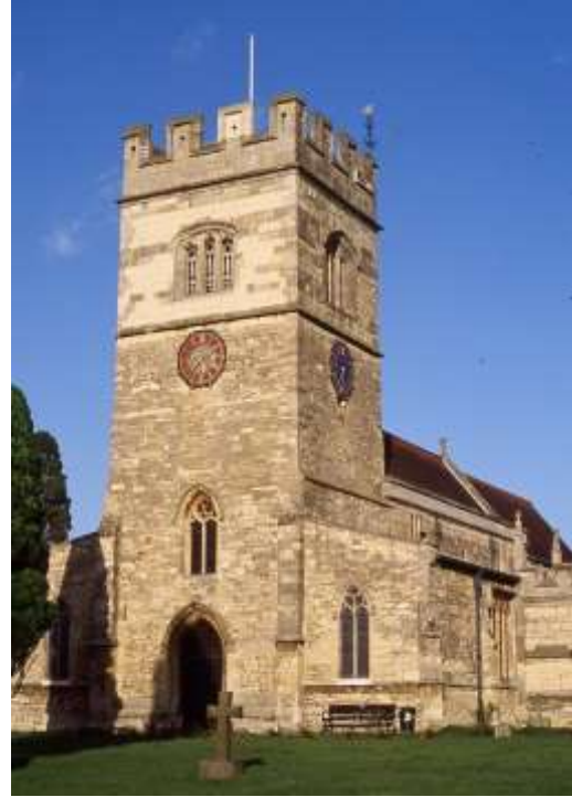
Figure 5: Tower, General View from the South-West