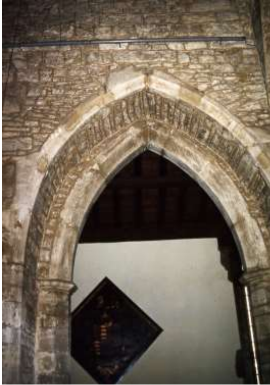
Figure 11: Tower North Arch, from South