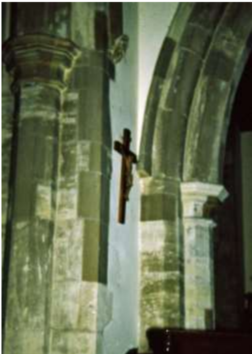
Figure 13: Capitals of Eastern Nave Bay and Chancel Arch Responds