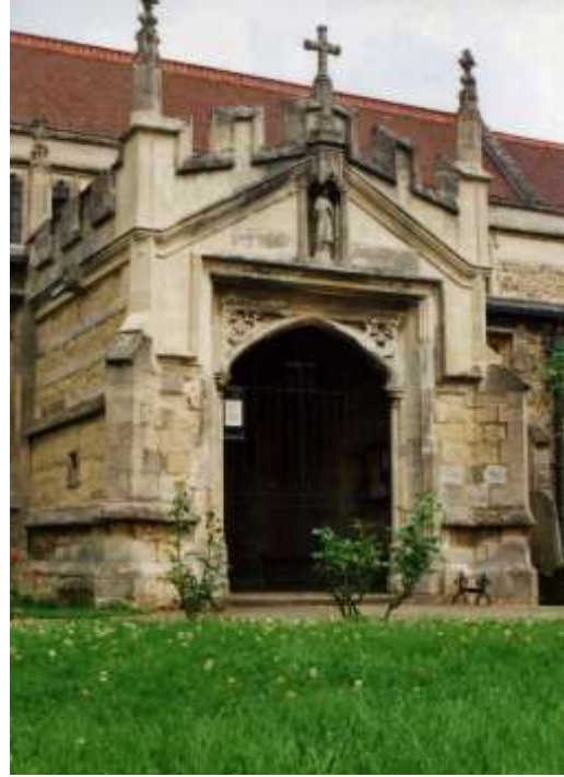
Figure 16: Porch