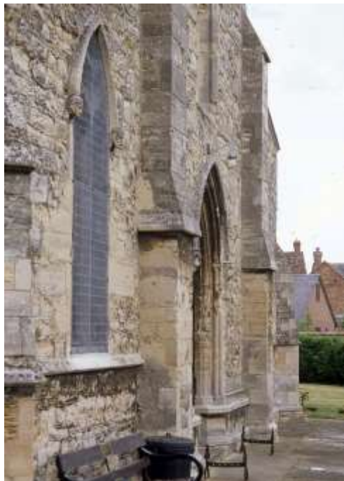
Figure 6: Tower Buttresses, from the North-West