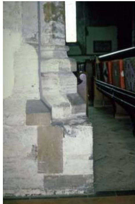
Figure 14: Base of Western Nave Bay Respond