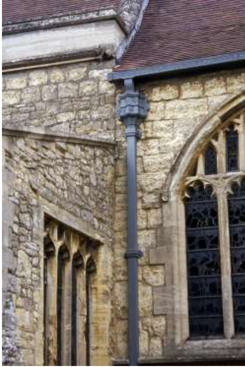
Figure 4: Nave, South-East Angle, Showing Ashlar Courses and Parapet above Clearstory