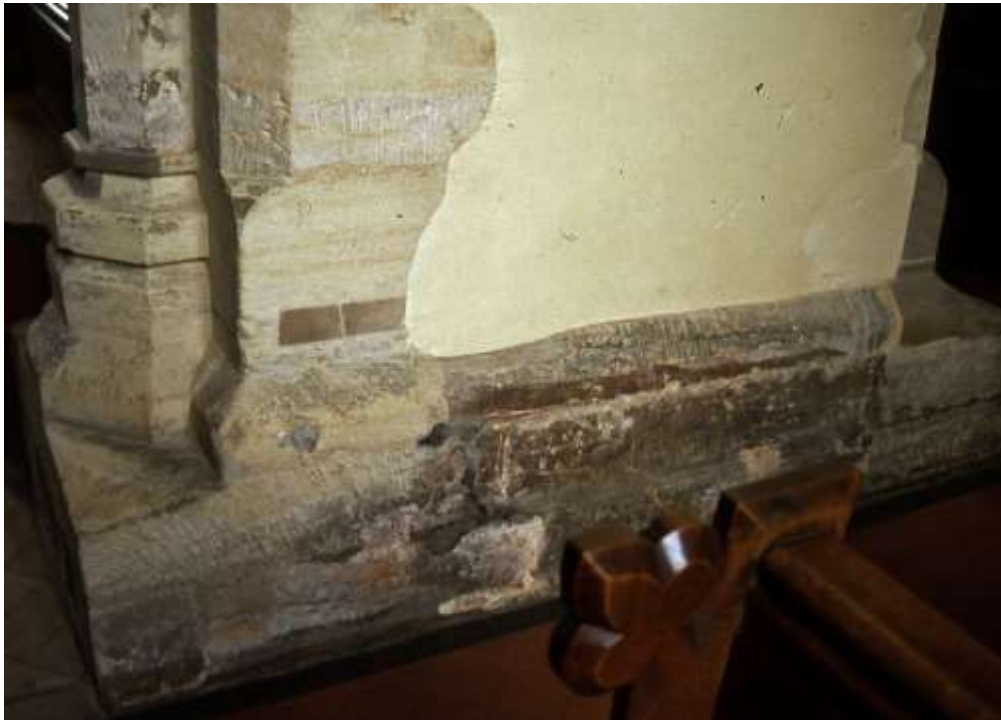
Figure 10: North-Eastern Tower Pier, North Side