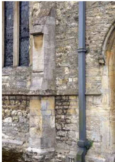
Figure 7: North Aisle: Lateral Buttress