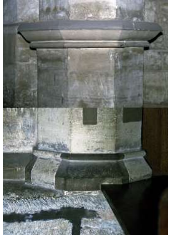
Figure 12: Capital and Base of Tower Arch Respond