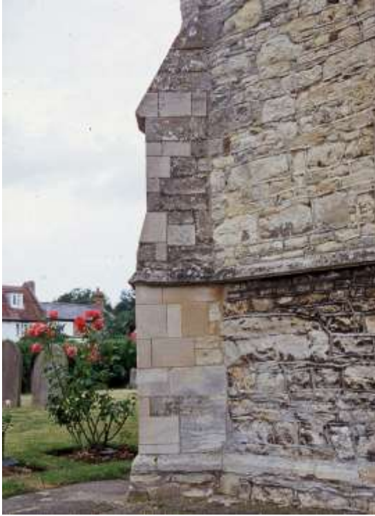
Figure 8: North Aisle Angle Buttress