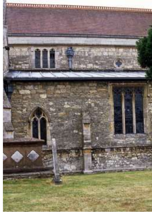
Figure 9: North Aisle Exterior